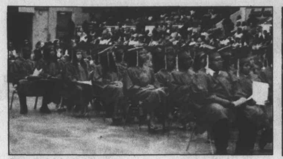
Carver High School graduates.