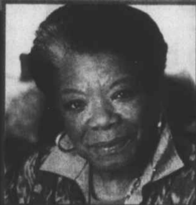
Maya Angelou Award-Winning American Author and Poet