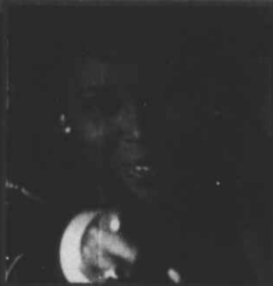
Tramaine Hawkins Granny, Dove and Stellar Award-Winning Gospel Singer