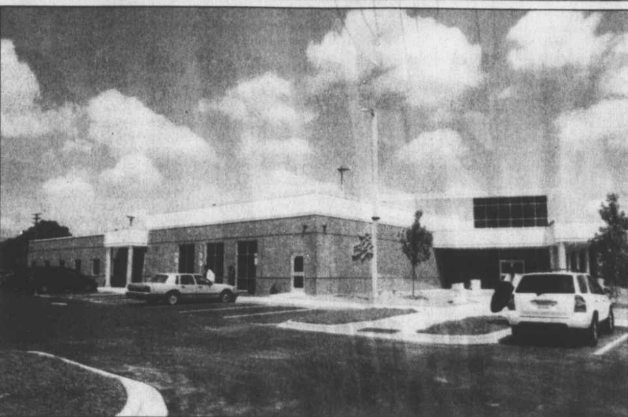
Left: Experiment in Self-Reliance's new headquarters at 3480 Dominion St.