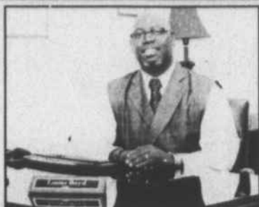
Friendship Baptist has a new pastor