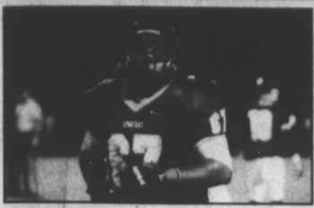
Mount Tabor getting ready