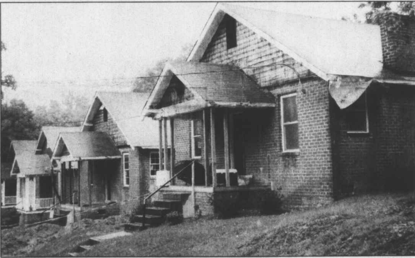
The future homes for veterans on Cameron Avenue.