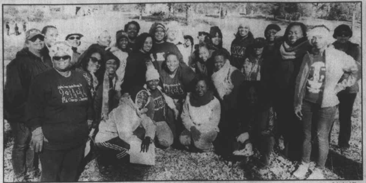
Members of the Phi Omega Chapter.