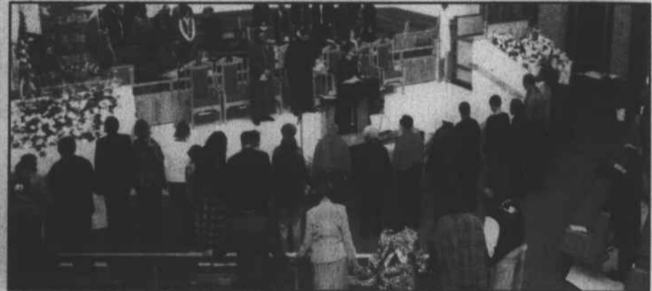
Church members and visitors alike gather around the altar in prayer during the Mount Zion Baptist Church Lenten Revival service.