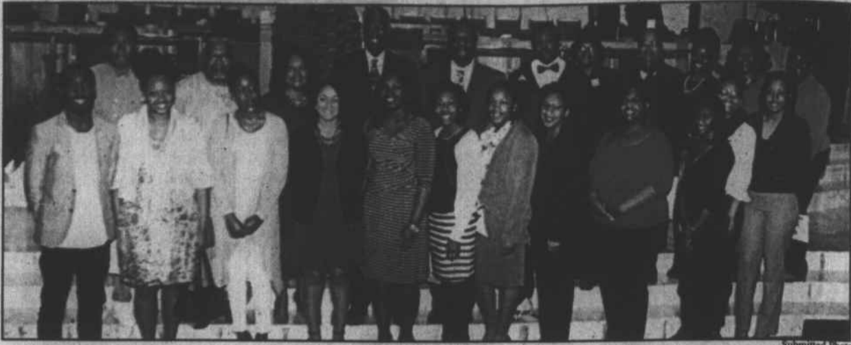
Emmanuel Baptist Church's Dr. Sir Walter Mack Sr. Annual Scholarship recipients gather for a photo.