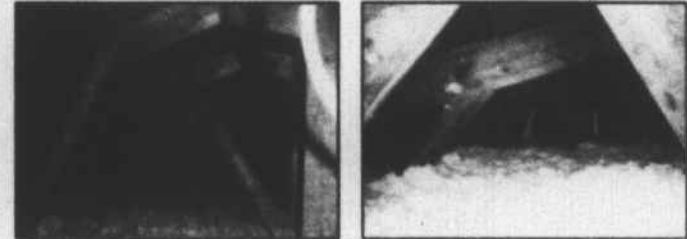
Addition of Attic Insulation: Increase from 3" to 11"

Many residents receive similar services. Pictured below are some examples of houses before and after work has been completed.