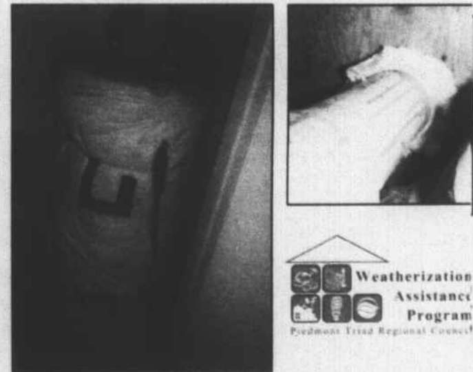
Water Heaters are wrapped to reduce heat loss. Penetrations from plumbing, wires, and wall tops are sealed to prevent additional air leakage.