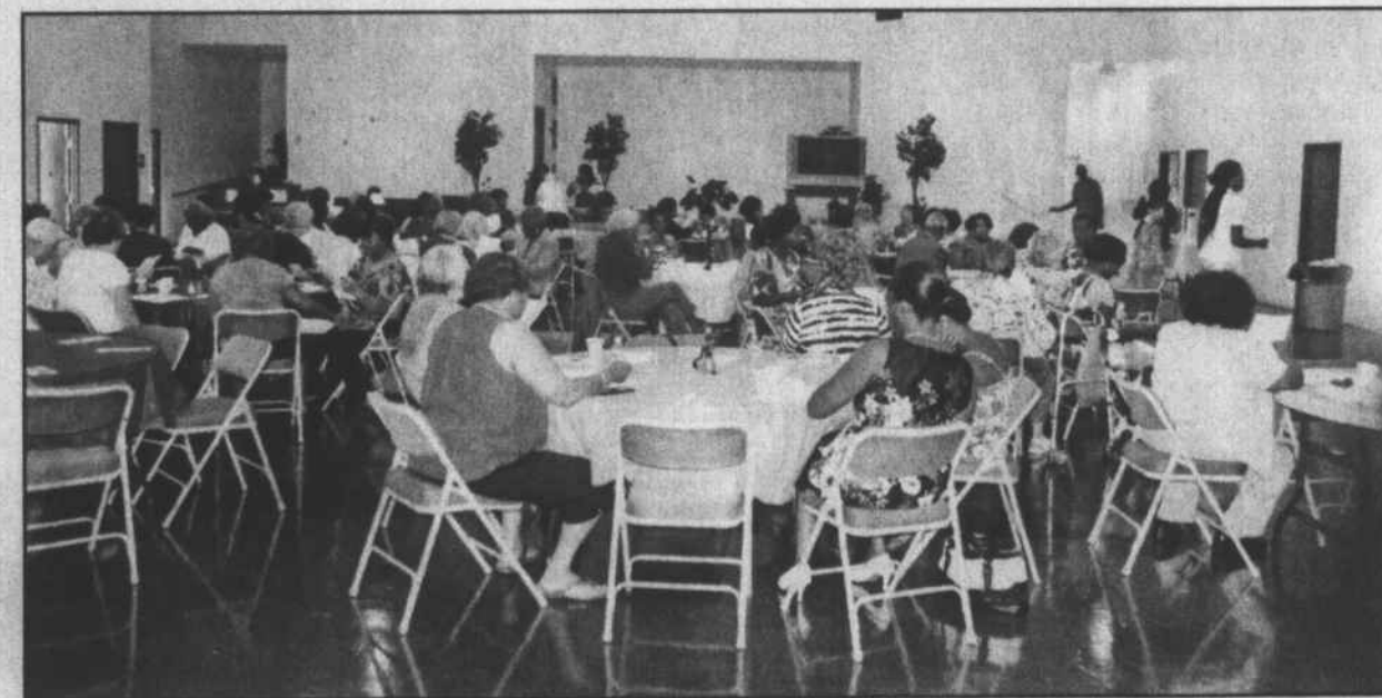
Members of Church Women United gathered at St. John Christian Methodist Episcopal Church on Saturday, Aug. 29 for a prayer breakfast. The breakfast was part of the organization's Human Rights Celebration.