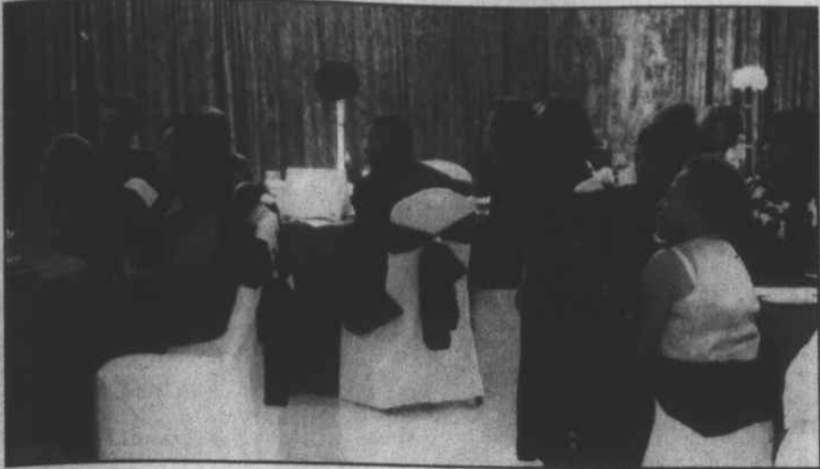
Winston-Salem State University Nursing Alumni and guests attend at the Scholarship Banquet on Oct. 29 at the McNeil Banquet Hall, Anderson Conference Center on WSSU's campus.