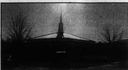
Members of the congregation of Carver Road Church of Christ prides themselves on not missing a Sunday service in many years.