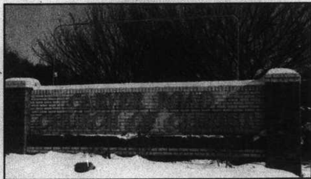
The Carver Road Church of Christ in Winston-Salem was one of the few churches in the area that decided to hold service this past Sunday amid the snow that covered the Triad.