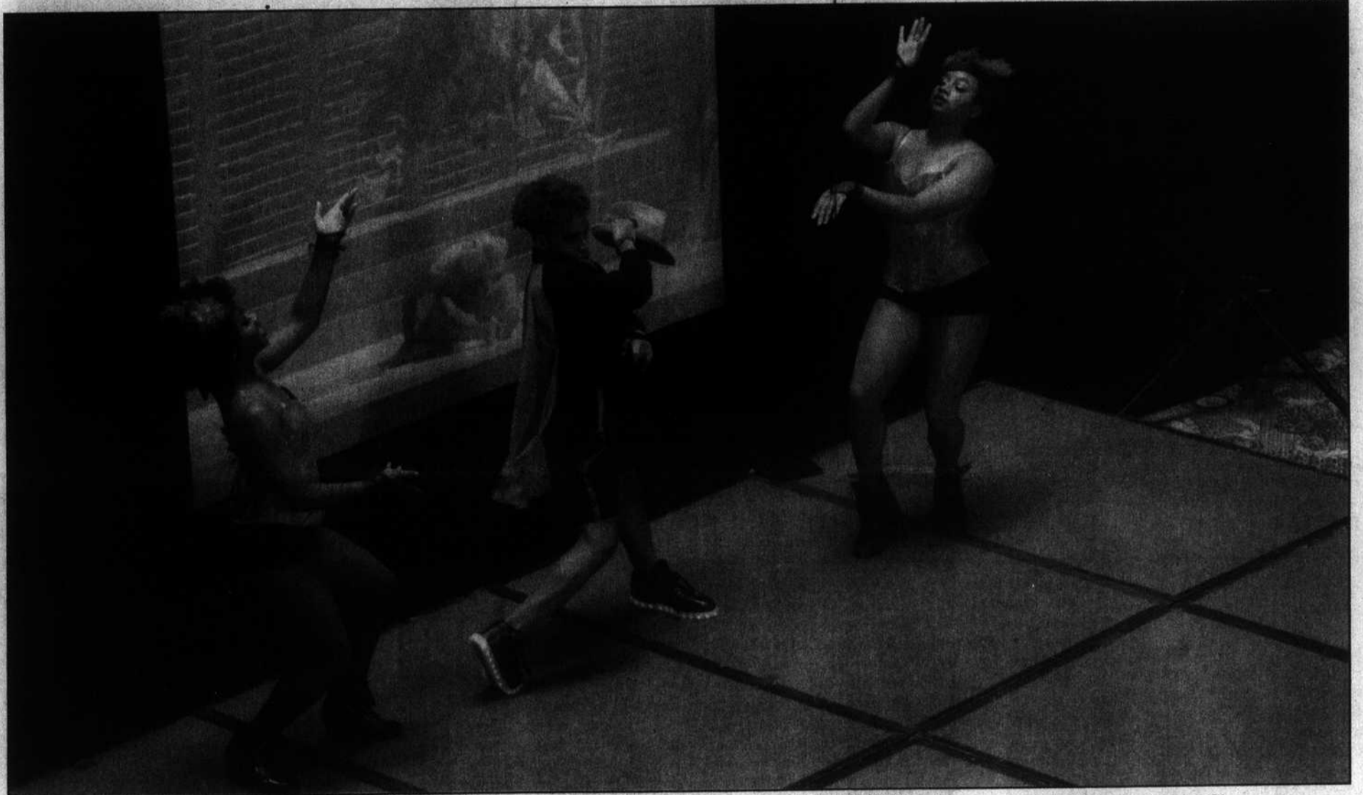
Members of THE POINTE! Studio of Dance perform an excerpt from "The Fantasy and Adventure of Oz: The Dance Adaptation of 'The Wiz'" during a press conference for the National Black Theatre Festival.