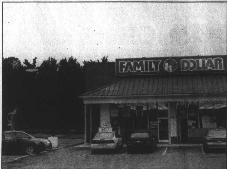
There is a planned cell phone tower that'll be located behind this Family Dollar at College Plaza Shopping Center.

* Commissioners authorized a refund for a $204,000 mishap with an excise tax on an e-closing real estate transaction. There was an error when the price of the house was accidentally put in the field for the tax before sending it to the Forsyth County Register of Deeds office, where the mistake was caught. The actual excise tax on the transaction was $408.