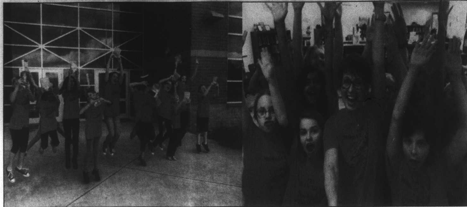
Morgan Elementary students show enthusiasm.