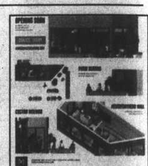
Last week Cam's Coffee Co. launched a crowdfunding cam-paign, which will help fund a new location in downtown Winston-Salem.

You can also make a donation by stopping by Cam's, 918 S. Broad St. The hours of operation are 7:30 a.m.-noon on Monday, Wednesday and Friday.