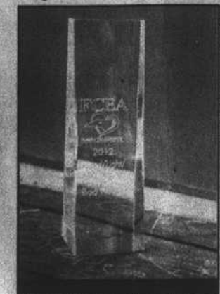
An example of an award given at the Forsyth County Entertainers Awards is shown.

raising money for the organization Authoring Action. The nonprofit has given out