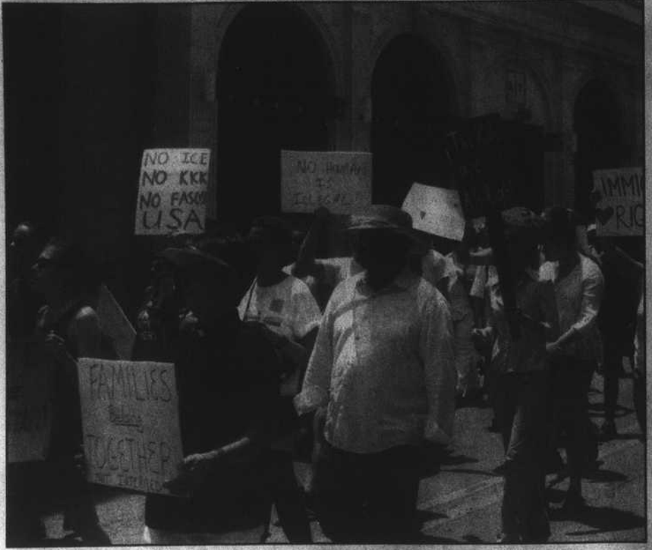
Winston-Salem was among many cities across the country with a protest on Saturday, June 30, against the Trump administration's policy of family separation.