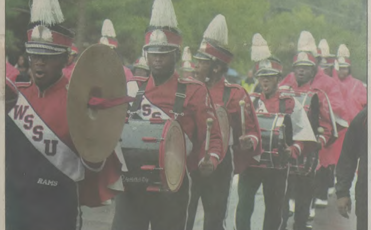
The Marching Red Sea of Sound led the way during the Homecoming Parade on Saturday, Oct. 20.