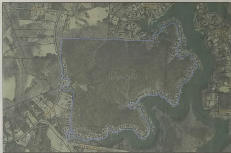
Forsyth County Image