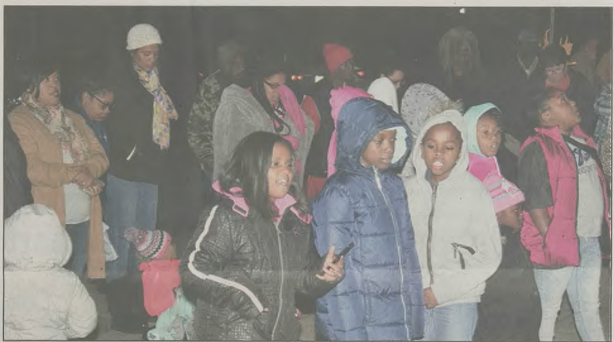
The community braved the frigid weather to come out for the Community Day for Cornerstone of Faith Ministries Inc.