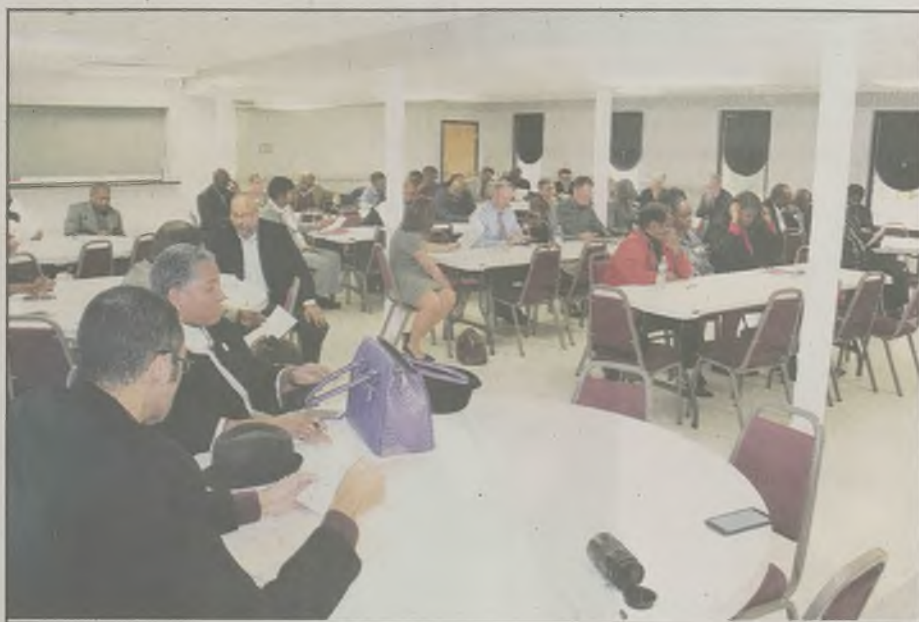
Conference members came out in full force to vote for their next officers.