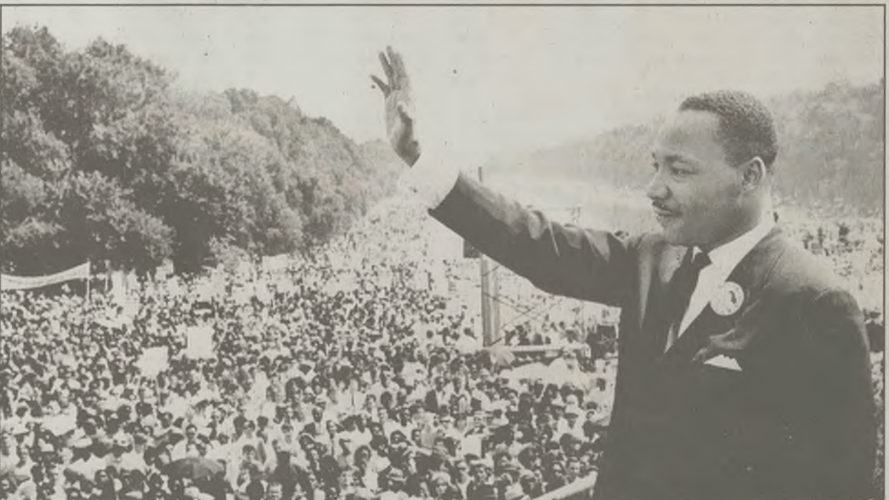
Dr. Martin Luther King Jr