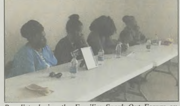
Panelists during the Families Speak Out Forum on Thursday, May 16, at Hanes Hosiery Recreation Cen-

Rally Up Winston-Salem is a local grassroots