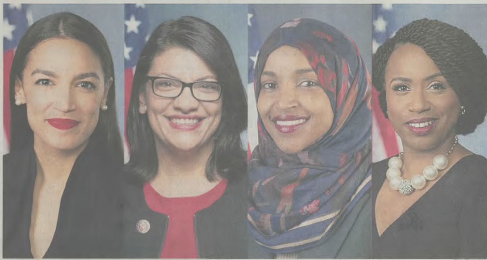
Recently President Trump tweeted that these congresswomen of color should "... go back and help fix the totally broken and crime infested places from which they came." Three were born in America and one was born in Somalia and secured asylum in the U.S.

Their company, Trump Properties, was sued by the Justice Department for housing discrimination against blacks in 1973. On May 1, 1989, Donald Trump took out ads in several of New York's major newspapers demanding that the Central Park Five be given the death penalty.