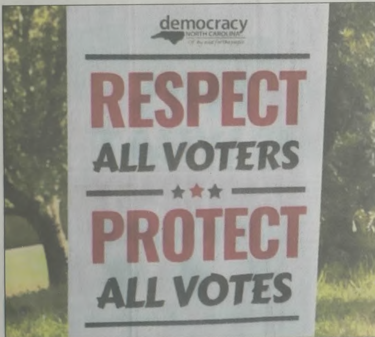
Democracy NC had several signs at voting precincts encouraging voters.

by his campaign that he believed he would win, but every vote had to be counted.