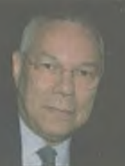
General Colin Powell and Dr. Madeleine Albright