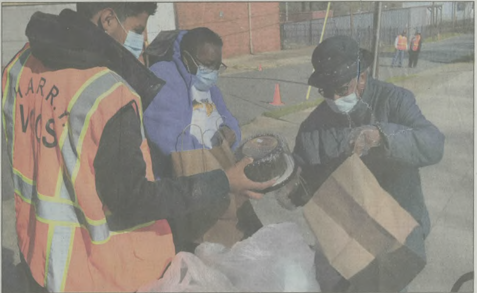
Volunteers with HARRY Veterans Community Outreach Services during the giveaway event on Saturday, April 3.