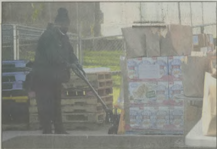
Most of the food distributed during the giveaway was provided by Crisis Control Ministry.

usually partner with local organizations to host giveaways with surplus food at the distribution center. McCall said the boxes had enough food for 3-4 meals.