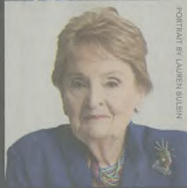
PORTRAIT BY LAUREN BULBIN