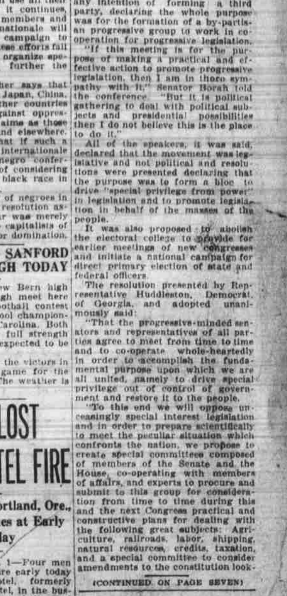
Portland, Ore., Dec. 1.—Four men lost their lives in a fire early today in the Ben Hur hotel, formerly known as the Oak Hotel, in the business district here. None of the dead had been identified several hours after the fire.