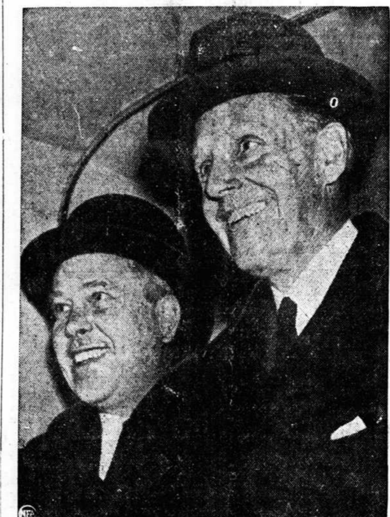
William Phillips, American ambassador to Italy, right, and Ambassador Hugh R. Wilson, recently recalled from Germany, appeared in jovial mood as they arrived at Warm Springs, Ga. They gave the President firsthand reports on Nazi and Fascist treatment of minorities.