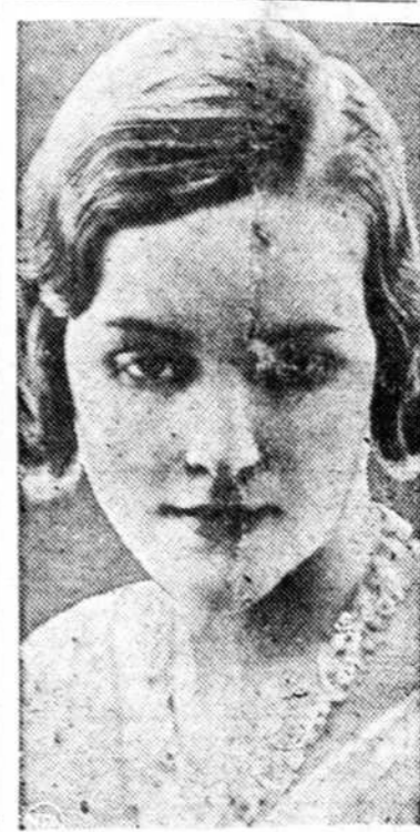
Adolf Hitler was "best man" for Sir Oswald Mosley, below, when the British Fascist leader secretly married Diana Freeman-Mitford, top, in the Fuehrer's Munich office last December. Hitler called her his "ideal Nordic woman."