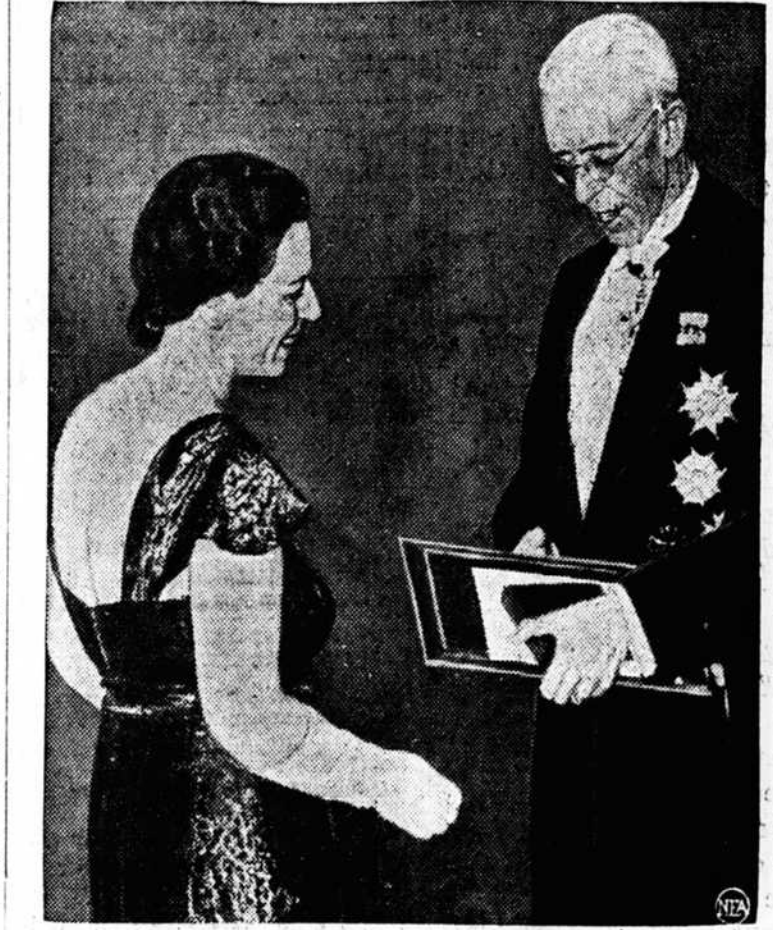
Smiling her pleasure, American authoress Pearl Buck receives the 1938 Nobel Prize for Literature from the hands of King Gustaf of Sweden.