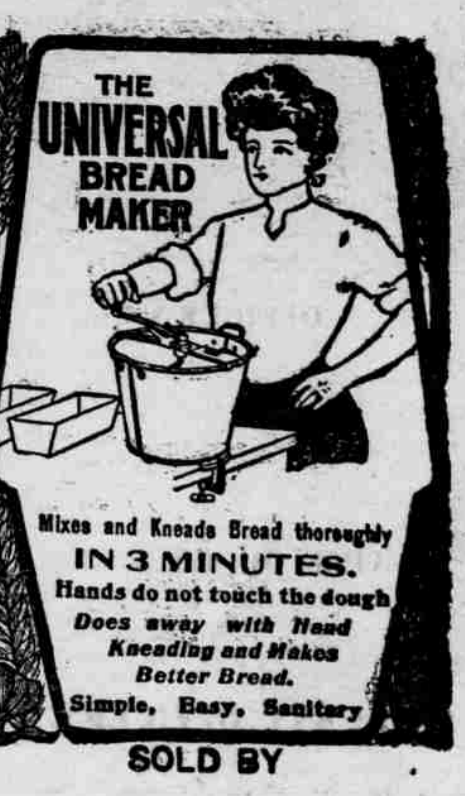
Mixes and Kneads Bread thoroughly IN 3 MINUTES. Hands do not touch the dough Does away with Hand Kneading and Makes Better Bread. Simple, Easy, Sanitary SOLD BY