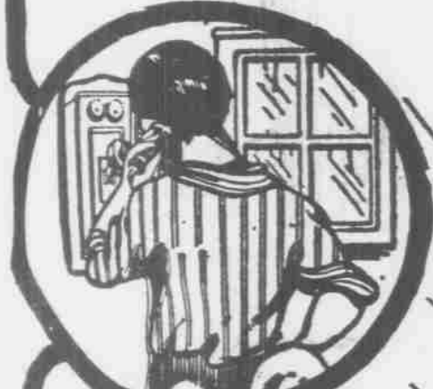
This farmer telephoned and—stayed at home.