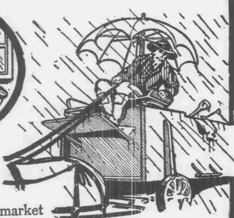
This farmer went to market.

And find the market unfavorable for your produce? The farmer who has a telephone in his home can telephone first. The useless trips thus saved are worth the cost of service.