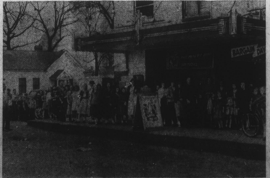
AND IT'S FREE, TOO—Well over a hundred youngsters crowded into the Peerless Theater in Erwin yesterday to take part in the usual Wednesday afternoon entertainment offered by the Union Juniors Club.

Give the youngsters wholesome entertainment and something to do in their spare time and they'll grow into good citizens.