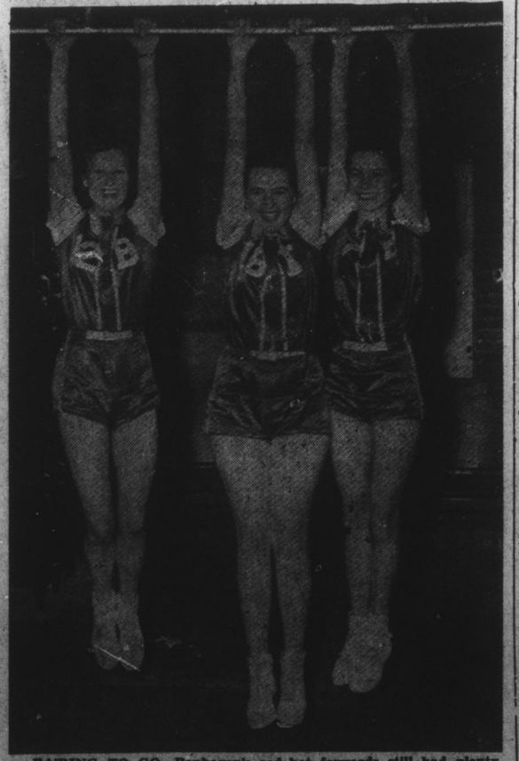
HAVING TO GO—Benhaven's red-hot forwards still had plenty of steam left Wednesday night after trouncing the LaFayette girls' team, 55-35, to take the county cage title.