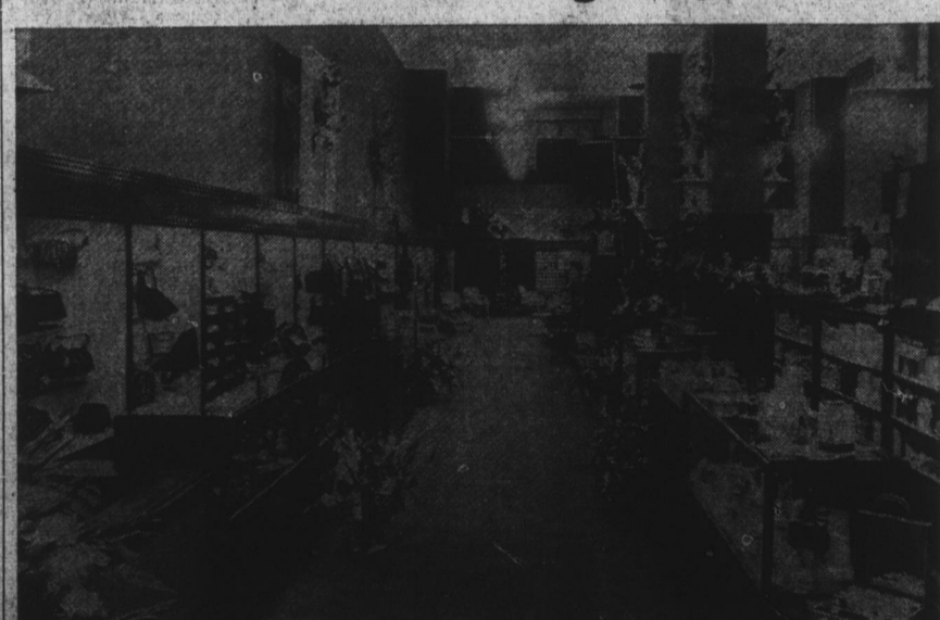
Here's how the new and enlarged Louis Baer Department Store will look when completed. It will have the same design and same type fixtures as those shown here.

Louis Baer's Department Store of Dunn has acquired the old location of the Carolina Power and Light Company next door to its present store on East Broad Street and today announced plans for enlarging and doubling the size of its store.