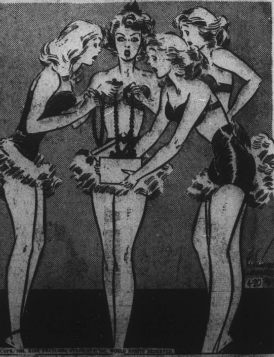
"Good heavens! Our costumes for the new show!"