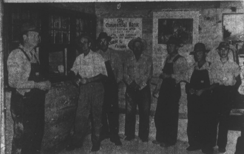
IT'S THE PAYOFF THAT COUNTS — Daily Record Photographer T. M. Stewart caught seven farmers at the window this morning as they received some more big, fat checks in exchange for their tobacco at the Farmers Warehouse.

TOKYO (AP)—The Communists broke off Korean armistice negotiations today on the ground that a United Nations plane bombed the Kaesong neutral zone, but a Peiping broadcast indicated the talks might be resumed as early as tomorrow.