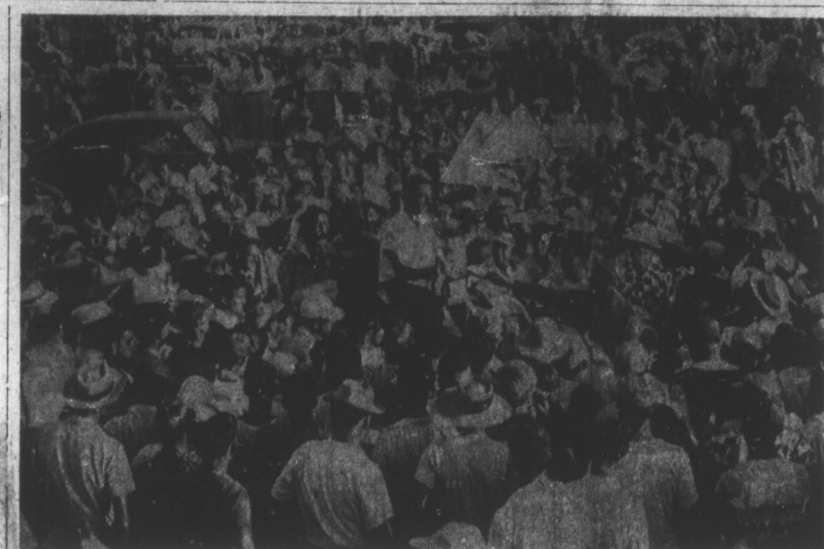
WINNING RACE DRIVER HERB THOMAS is shown in the photo above sitting on top of the Hudson Hornet that he drove to victory in America's largest and finest Stock Car Race. Thomas, of Olivia, N. C., averaged better than 77 miles per hour as he outran 80 other stock automobiles for 500 miles to win the Darlington '500' or Labor Day Race.

The crusade, which will encompass Protestant faiths as well as the Catholic creed, is part of a program begun over three years ago by Father Patrick Peyton of Albany, N. Y.