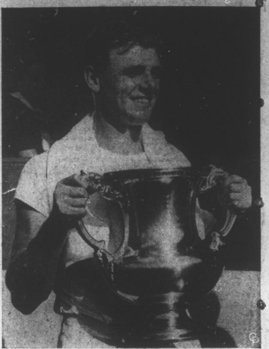
THE TENNIS PERFECTIONIST, Frank Sedgman of Australia, holds the cup he won after defeating Vic Seixas of Philadelphia, in the finals of the U.S. men's tennis singles championships, at Forest Hills, New York. Sedgman is the first foreigner to win the United States tennis crown in fifteen years. He beat Seixas, 6-4, 6-2, and 6-1.