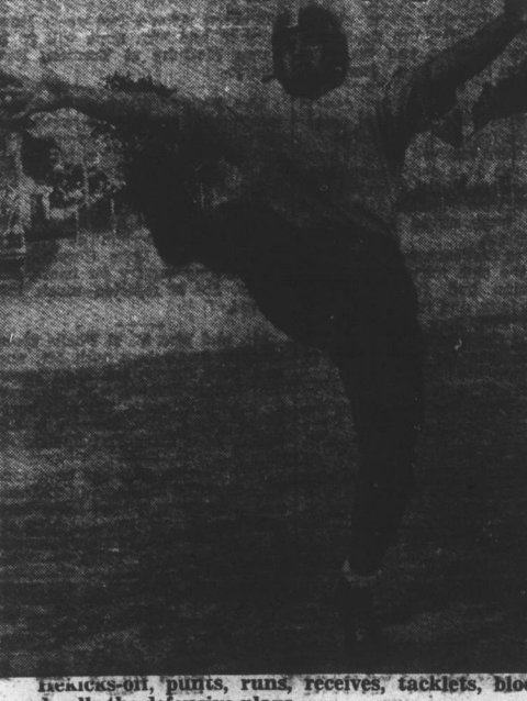
TRICKS-ON, punts, runs, receives, tackles, blocks, and calls the defensive plays.