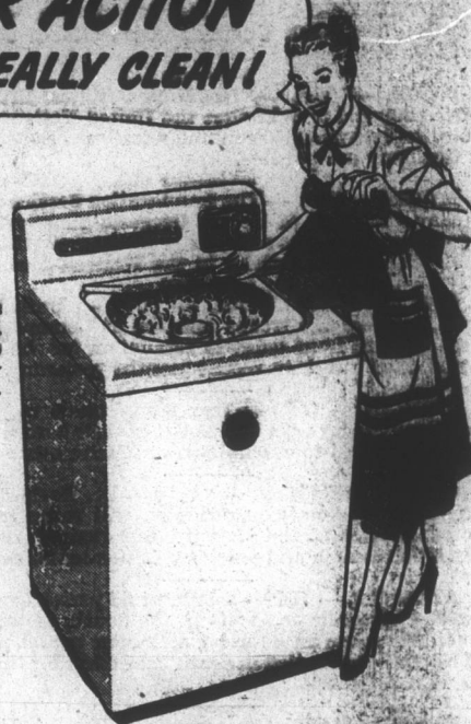
Come In. Ask about Frigid!

Lets you pre-select the washing time you want—even for Rayons, Nylons and Woolens. The Frigidaire Washer does all the rest—all automatically!