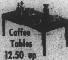
Coffee Tables 12.50 up

We are Proud to Present For Your Comfort and Economy Our Various and