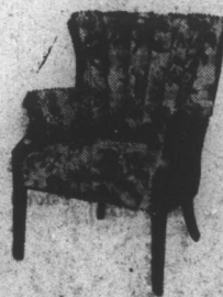
Chairs From 29.50 up

and Tables, Matchless For Their Beauty and Comfort.