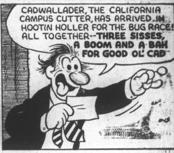
BLONDIE-By Chic Young