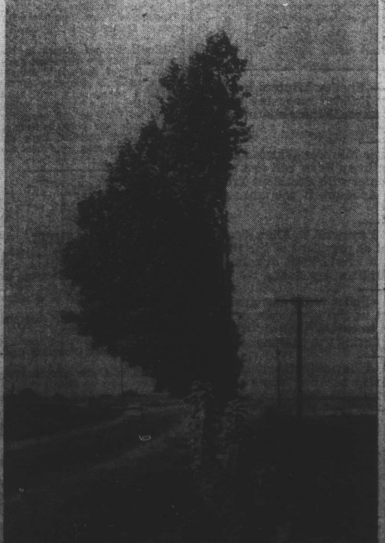
FOR TREES — Pictured here are two trees, although they appear in the photograph as only half a tree. The unusual effect was caused by the cutting of two sweet gum trees, on Highway 421 about four miles west of Lumberton by the Carolina Power and Light Co., to accommodate their power lines.

KANSAS CITY, Kan. — (UP) — Two men clad in white overalls, one of them armed with an M-1 Army rifle, robbed the Johnson County National Bank of $62,000 to-