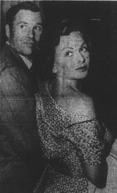
BACK VIEW or front view, Jeanne Crain rates among the Film City's loveliest stars. Here the glamorous mother-of-three arrives at the theater with husband, Paul Brinkman.