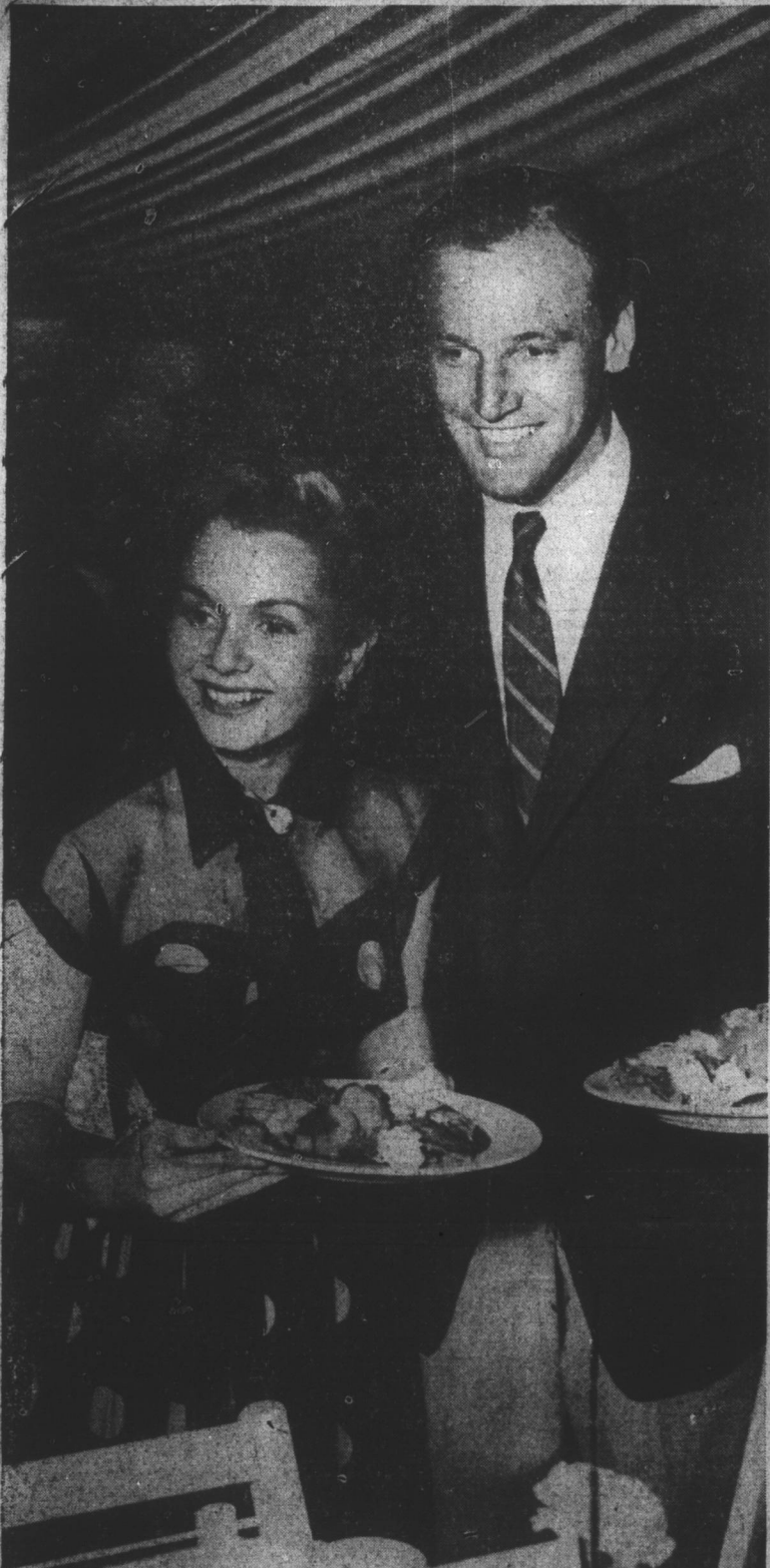
MOVIELAND NEWCOMERS , Debbie Reynolds and Richard Anderson are rapidly proving themselves to be popular additions to the ranks of "new faces" in films. Seen at a buffet party, they have shared a number of dates since becoming acquainted a short time ago.