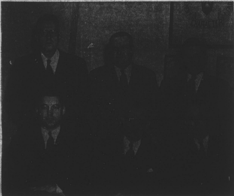
UMSTEAD WITH FARM BUREAU LEADERS—Former U. S. Senator William B. Umstead, seated center, a candidate for Governor, addressed the annual meeting of the Harnett County Farm Bureau yesterday afternoon.