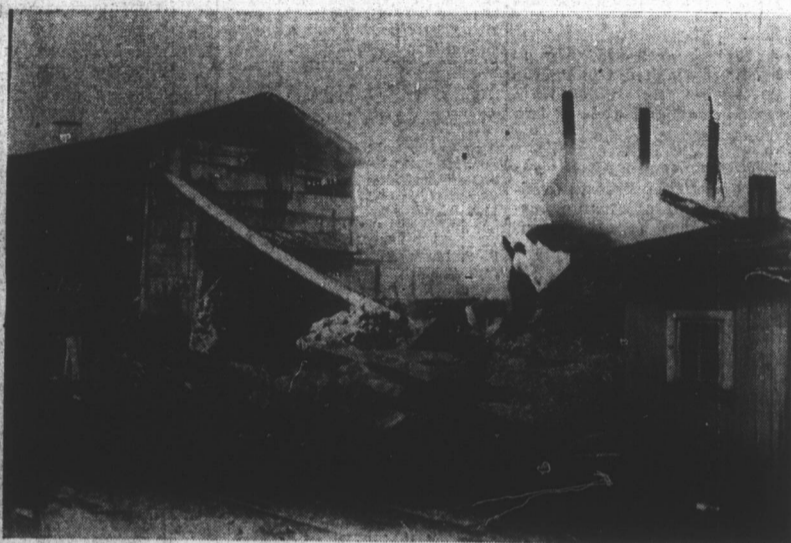
SCENE OF FIRE - The shambles and ashes shown in the center this morning was all that was left of the big seed house at the General Utility Company in Dunn. A truck parked under the seed house caught fire and the blaze completely demolished the structure. The blaze also spread to the gin.

The loss, he said, was only partially covered by insurance. General Utility Company is one (Continued On Page Two)