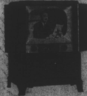
New Zenith "Theater" TV Console, Model J2054R, 20-inch (21 1/2 in.) "Electronex" Tube screen. Hand-finished Mahogany veneer and selected hard-wood Hignalite nylon.