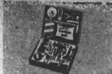
For Small Fry Barbering BARBER SET