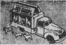
PET SHOP DELIVERY TRUCK