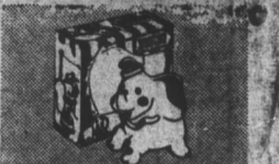
Whistles When Squeezed DUMBO THE ELEPHANT