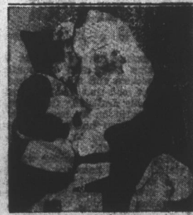
SECRETS . . . This little girl wants something for Christmas, but she's not telling anyone except Santa Claus, who looks like he understands the problem.

The original game called for a quantity of raisins to be deposited in a large bowl or dish. Brandy or some other spirit was then poured over the fruit and ignited. At a given signal, the participants attempt to snatch a raisin from the blazing bowl.