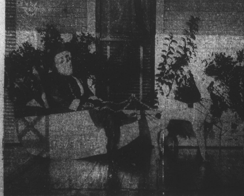
THIS SANTA'S TOURIST — Mrs.... of... who lives on... School, each year has an attractive and original Christmas decoration and each year hundreds of tourists stop to see it and visit with Mrs.... The... Harnett woman points out that this Santa Claus and reindeer set actually cost her less than $10 to erect. This shows what a... originally and talent will do.