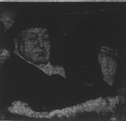
BRITAIN'S PRIME MINISTER, Winston Churchill, presents a picture of relaxation as he settles back in his limousine, lights up a cigar, and waits to be taken to 10 Downing Street in London. He had just returned from conferences in Paris with General Dwight Eisenhower and other Allied leaders on North Atlantic Treaty Organization plans.