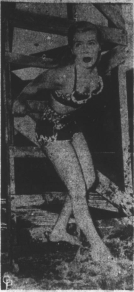
EASTERNERS, whose swimming pools are ice covered these days, may find it difficult to understand the hesitancy of Laura Elliot, Hollywood film starlet, as she tests the water temperature before plunging in. It seems even California pools can be chilly at times.